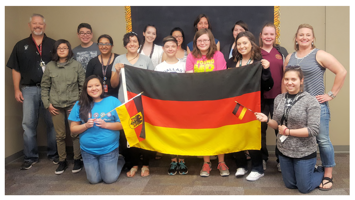
APHS students and sponsors getting ready for the visit of their German exchange students

This school year marks the 30<sup>th</sup> anniversary of the youth exchange between Albert-Schweitzer-Schule (ASS) in Nienburg/Germany and high schools in Las Cruces. For 20+ years, it was running strong between ASS and Mayfield High School (MHS). In 2012, it moved to Centennial High School and finally in 2016/17 to Arrowhead Park High Schools (APHS). It is now taking place within the framework of the German American Partnership Program (GAPP) and the Las Cruces-Nienburg Sister Cities Affiliation. (The Las Cruces-Nienburg partnership started in 1993 through the student exchange between ASS and MHS.)