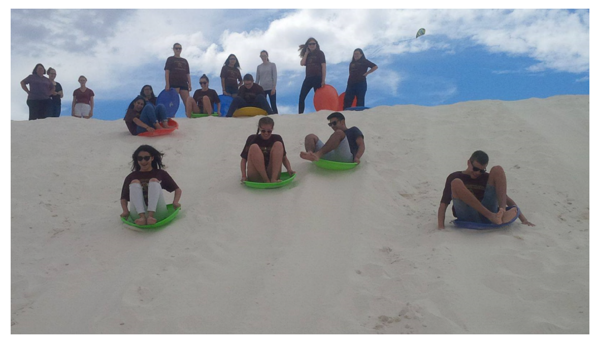
White Sands Spa\beta = fun

On Sunday, 9-25, the Germans and their hosts gathered at White Sands National Monument. The students learned about the geology, flora and fauna from the exhibits at the Visitor Center and from a ranger presentation. Naturally there were also a picnic and fun in the dunes, always a highlight for visitors from Germany. They love the white sand that reminds them of the white beaches on the North See and frequently ask: "Now – where's the water?"